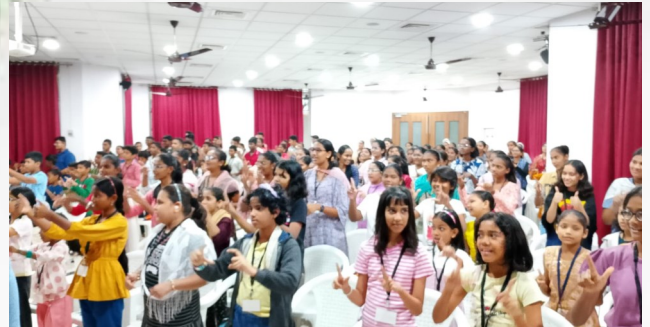
Pics from the children's retreat at Rajkot : LOC team & kids